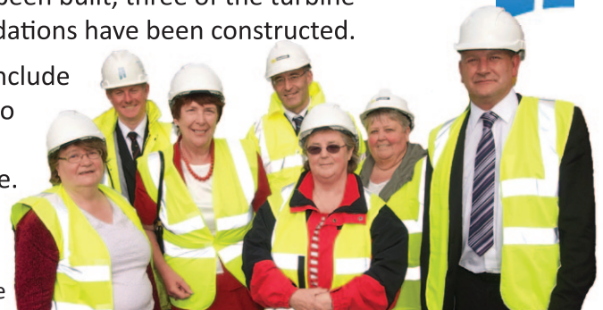
Helen Eadie MSP and David Torrance MSP visit the site

Overall the project is expected to take fourteen to sixteen months with completion due at the end of 2012.