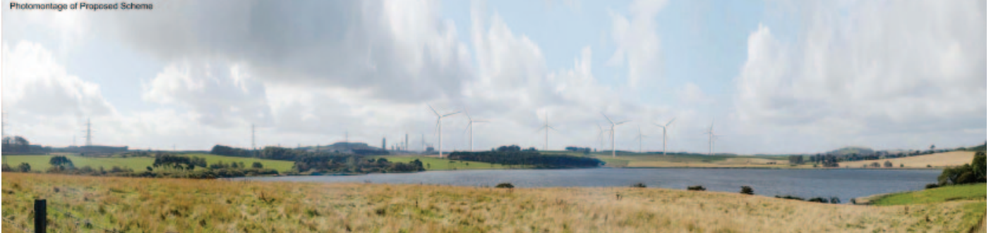
Photomontage of Proposed Scheme